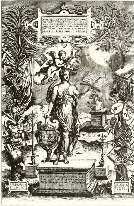
Figure 16. "Antwerp Polyglot" Bible ( Biblia Sacra Hebraice, Chaldaice, Graece & Latine ), by Pieter van der Heyden (Flemish, act. 1500s) after Pieter van der Borcht (Flemish, act. 1500s), Flanders, Antwerp, 1568. Typeset folio, 39.37 x 28.12. Houghton Library, Harvard University (purchased from John W. Smith on 27 Nov. 1811)

intricately rendered Portuguese jug, which was probably drawn from life, and he replaced the crutch of the main figure to the right with a rapier.